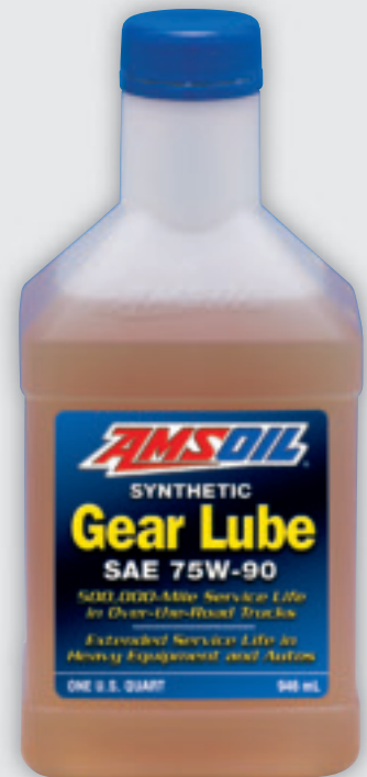
75W-90 (FGR) & 80W-140 (FGO)